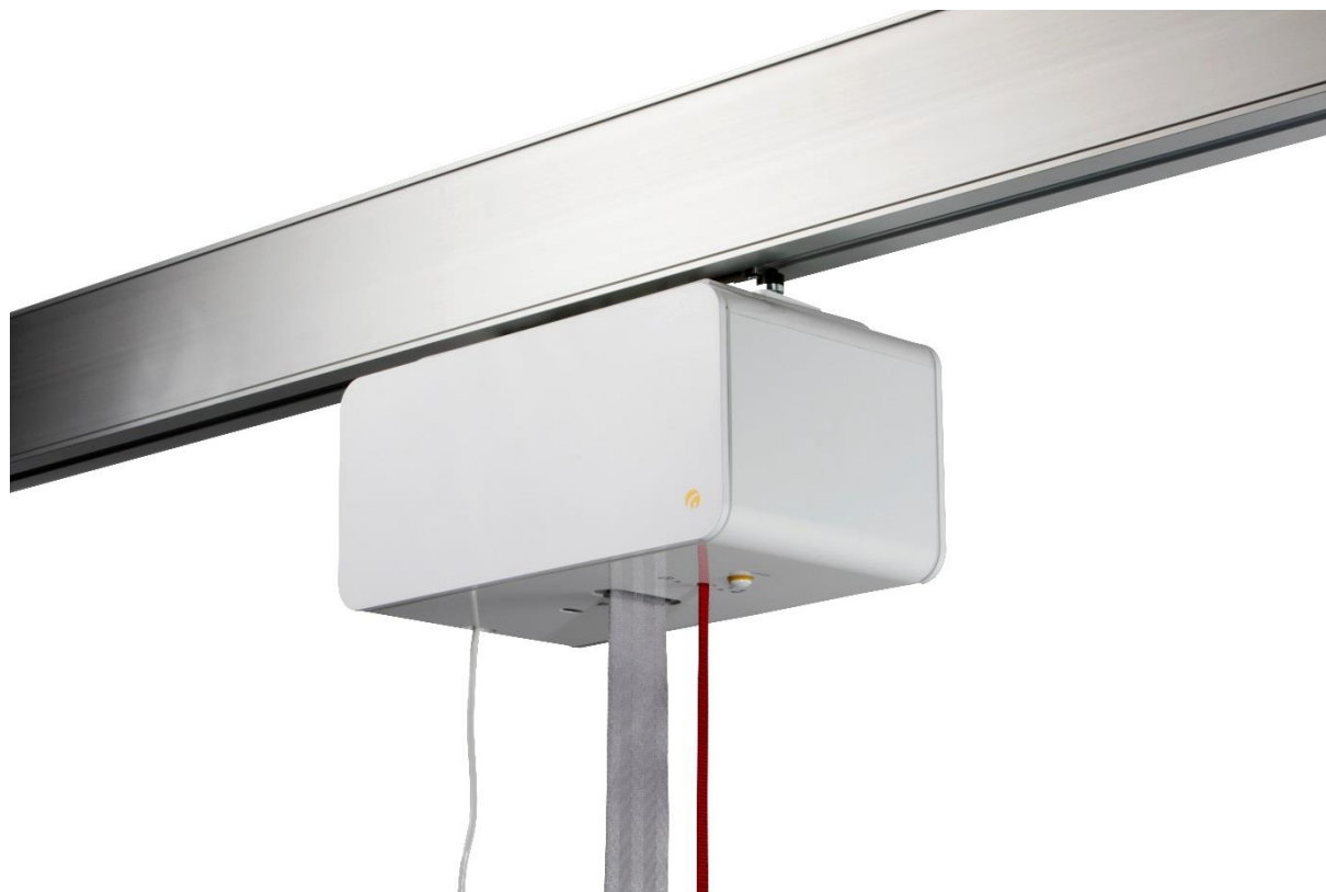
Figure 1 Scale in single hoist version