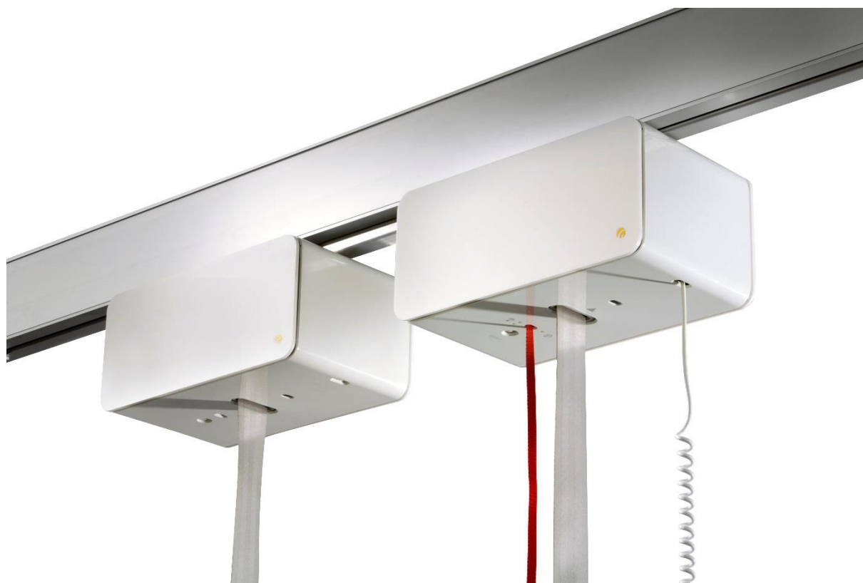
Figure 2 Scale in twin hoist version